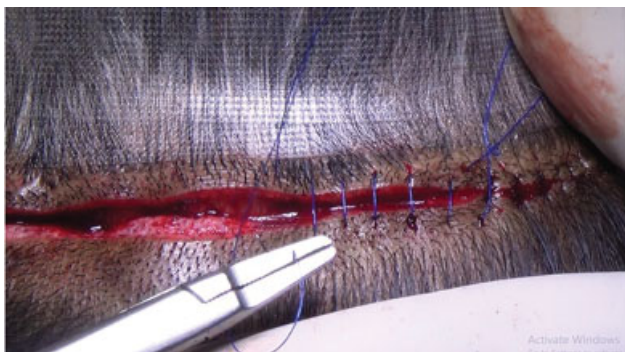
Fig. 5 Skin closure using continuous sutures of 4-0 Prolene.

The skin is closed with either 4-0 Prolene or 4-0 Rapide Vicryl in case the patient cannot return to remove the stitches. Nylon is avoided as its color may resemble the black color of the hair and makes it difficult to identify during removal. The author uses a personalized technique of giving 20 to 30 bites simultaneously before pulling the sutures in one go to tighten them ( Fig. 5 ). This gives better control