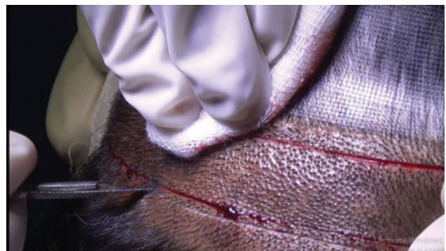
Fig. 2 Scoring the trichophytic incision below the inferior border of the incision.

incision using a double-bladed knife. The lateral limits of donor area scored with no.15 blade and joined with the previously made incision. The author prefers to score the trichophytic incision ( Fig. 2 ), 1- to 2-mm inferior to the lower margin of incision, as the angulation of the hair and the overhanging ledge of the superior margin makes it look more natural. Normal saline without adrenaline is injected into the subcutaneous fat plane to hydrodissect the strip and minimizes bleeding. The incision is deepened into the subcutaneous fat, following the angulation of hairs, to avoid injury to the hair follicles. The strip is excised using two double-