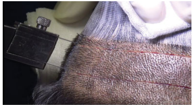
Fig. 1 Double-bladed knife with spacers for scoring incision to give a parallel cut.

The incision is scored into the epidermis and superficial dermis using a double-bladed knife with spacers to adjust the width at the occipital region. Fig. 1 shows the scoring