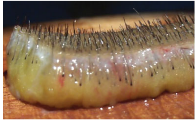
Fig. 6 Harvested strip with intact follicles.

during suturing with more symmetry, and thereby resulting in near-perfect closure and a better scar. Fig. 6 shows harvested strip using the traction technique.