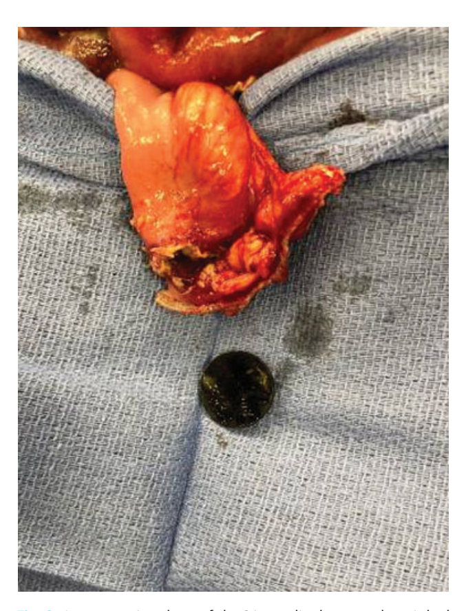
Fig. 2 Intraoperative photo of the 21 mm disc battery where it had eroded and perforated the anastomosis. Note the significant acute and chronic inflammation of the bowel.