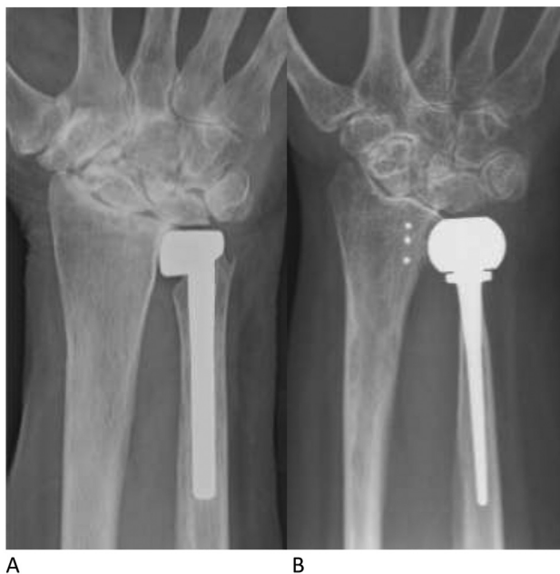
Fig. 3 Radiographs 1 year after ulna head replacement with bone resorption beneath the ulnar head in (A) partial ulna head and (B) total ulna head in two female patients with rheumatoid arthritis.

resorption was more pronounced in the total than in the partial ulna head replacement at the 1-year radiographs (►Table 2; ►Fig. 3). The intraoperative/immediate postoperative filling ratio did not affect the 1-year radial BRI, as analyzed by one-way ANCOVA adjusted for diagnosis, sex, and prosthesis design, filling ratio collar ( p=0.36 ), mid ( p=0.35 ), and tip ( p=0.38 ).