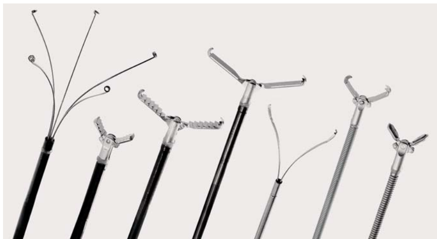
Fig. 4 Retrieval graspers and grasping forceps.