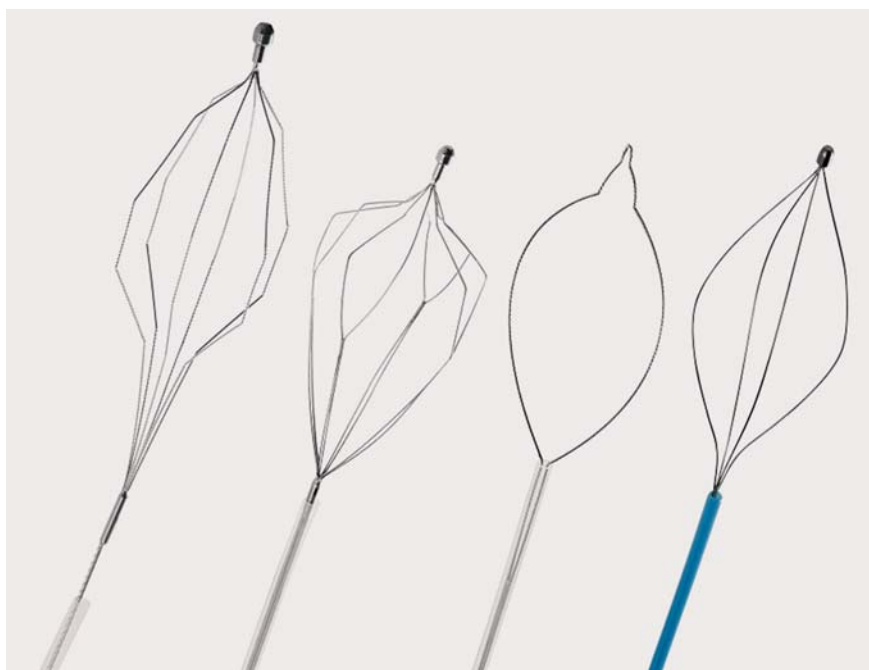
Fig. 5 Baskets and snare.