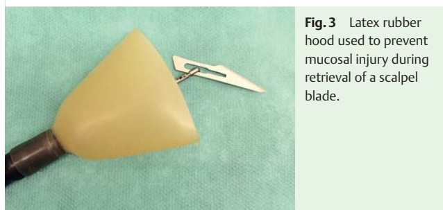
Fig. 3 Latex rubber hood used to prevent mucosal injury during retrieval of a scalpel blade.

12,14,19,25,29,39]. The choice of retrieval device is determined by the size and shape of the foreign body ( Table 4 ; Fig. 4 and Fig. 5 ), by the endoscope length and instrument channel, and by the endoscopist's preference and practice. Removal of foreign bodies with standard biopsy forceps is rarely successful because of the forceps' small opening width, and cannot therefore be recommended [3]. Retrieval forceps have a large variety of jaw configurations: rat-tooth, alligator-tooth, or shark-tooth. Retrieval graspers with two to five prongs can be useful for retrieving soft objects, but not for harder or heavy objects because the grip is not secure enough. Polypectomy snares are widely available and inexpensive. Endoscopic baskets may be useful for round objects, and retrieval nets or bags can provide a more secure grasp for some foreign bodies (coins, batteries, magnets) and for en bloc removal of food boluses.