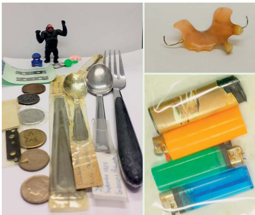
Fig. 1 Examples of foreign bodies retrieved from the upper gastrointestinal tract.

piration of saliva or from tracheal compression by the foreign body. Hypersalivation and inability to swallow any liquids are suspicious for complete esophageal obstruction [3–7, 10–15]. When the foreign body has passed the esophagus, the majority of patients remain asymptomatic but a sensation of foreign body, with dysphagia, can persist for several hours and thus can mimic a persisting foreign body impaction.