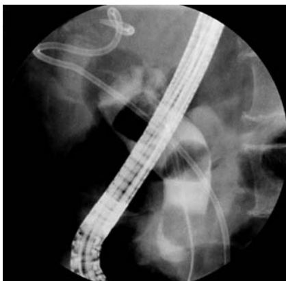
Fig. 1 Cholangiogram showing multiple large stones in the common bile duct of a 93-year-old man with no pre-existing illness, presenting with abdominal pain, fever, and jaundice of several days' duration.

reactivation of tuberculosis complicated by severe hospital-acquired pneumonia.