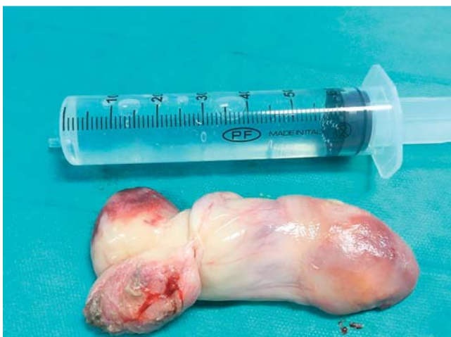
Fig. 2 Macroscopic appearance of the resected polyp.