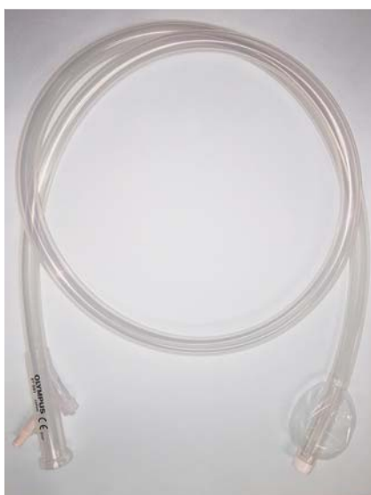
Fig. 1 Overtube (single-use splinting tube, OLYMPUS, Tokyo, Japan).

In all three patients, the entire colon could be filled with a total volume of barium of about 1200 mL to 1500 mL without adverse events such as perforation. Abdominal radiography on the day following treatment showed barium remnants in the diverticulum (Fig. 3). All three patients had favorable courses with control of bleeding after treatment. Barium in the intestinal tract outside the diverticulum was excreted without additional laxatives, with no ileus symptoms, diverticulitis, or appendicitis.