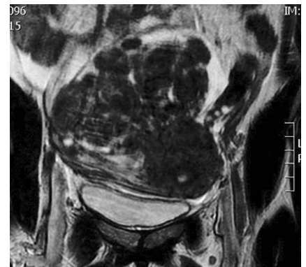
Fig. 1 Coronal T2-weighted MRI image depicting an irregular uterine mass composed by many incompletely confluent nodules.

Cotyledonoid dissecting leiomyoma is a distinctive variant of dissecting leiomyoma that is characterized by reddish, exophytic, placenta-like gross appearance and by its frequent extrauterine extension into the adjacent tissues and pelvic cavity [Smith CC. Int J Surg Pathol 2012; 20: 330–341]. The ultrasonographic and radiological (MRI) features of cotyledonoid dissecting leiomyoma are not particularly different from those of typical myomas. Nevertheless, the 3D ultrasound reconstruction of this uterine tumor seems to be more specific, as it is depicted by one or more large and lobulated masses with many partially confluent patchy nodules of different sizes, delimited by an irregular capsule [Raga F et al. Cotyledonoid dissecting leiomyoma of the uterus. Fertil Steril 2009; 91: 1269–1270]. The recent advent of HDlive technology into prenatal diagnosis, gynecology and re-