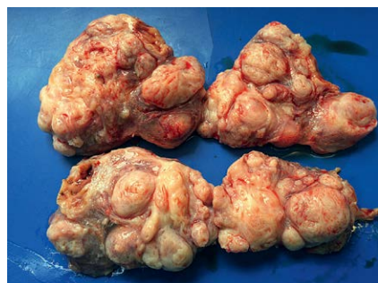
Fig. 3 Pathological examination confirming a cotyledonoid dissecting leiomyoma.

productive medicine has enhanced 3D/4D ultrasound diagnosis [Raga F, et al. Ultrasound Obstet Gynecol 2016; doi: 0.1002/uog.15727]. In our case, HDlive imaging proved to be a valuable tool for lucidly investigates this uncommon uterine tumor, establishing an accurate diagnosis.