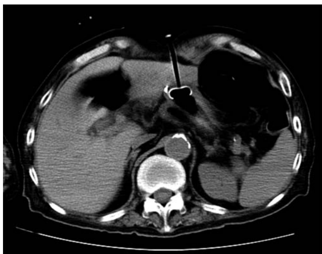
Fig. 2 Computed tomography (CT) scan showing the percutaneous endoscopic gastrostomy (PEG) tube passing through the lateral segment of the liver after a mispuncture during insertion.

Ezekiel Wong Toh Yoon, MD Department of Internal Medicine Hiroshima Kyoritsu Hospital 2-20-20 Nakasu Asaminami-ku Hiroshima City Japan easybs@hotmail.com