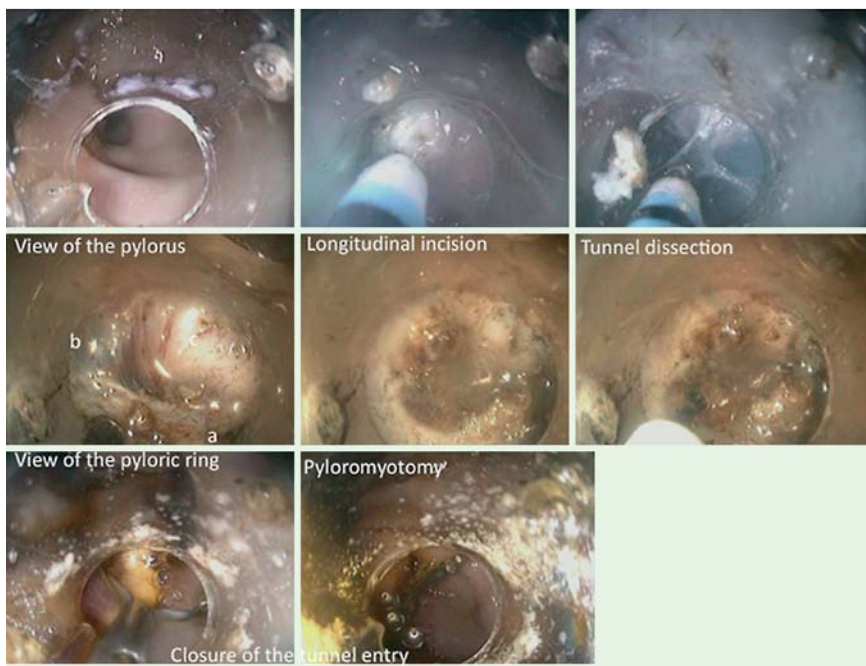
Fig. 1 Peroral pyloromyotomy. a, pyloric ring; b, submucosa of the bulb; c, mucosa of the bulb.