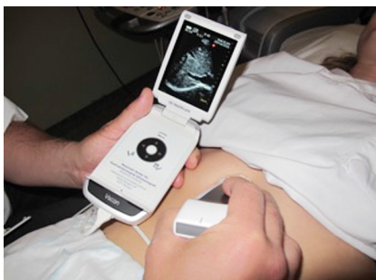
Just one example of the many handheld devices available

Point-of-care ultrasound and emergency medicine are areas where handheld US devices could prove useful and where the lack of high-end features of the device will not be a limitation. In other medical fields the lack of optimal conditions for performing US may limit the value of the examination. For instance, the best discrimination of grey scale pixels requires a dark room and the reflectivity of the screen of the device may also limit the examination.