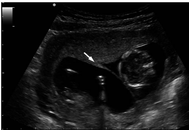
Fig. 3 Dichorionic twin pregnancy with λ-sign (→), 12 weeks.