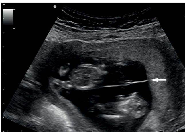
Fig. 4 Monozygotic diamniotic twin pregnancy with T-sign (→), 12 weeks.

Screening should include an assessment of the anatomical integrity of the embryo/fetus. This includes (DEGUM):