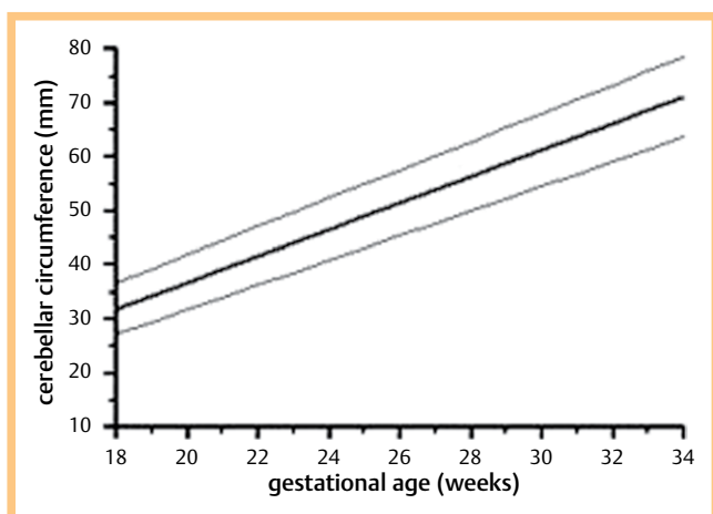
Fig. 2 Plot showing the cerebellar circumference observed measurements and the fitted 10 th , 50 th , and 90 th percentiles for gestational age.

Data are presented as mean ± SD where applicable