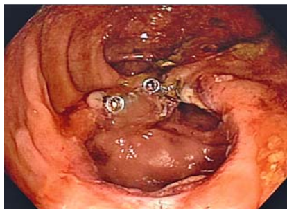
Fig. 5 Bowel wall after treatment with needle-knife stricturotomy, stone retrieval, and clip placement.