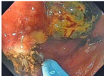
Fig. 3 Needle-knife stricturotomy to the bowel wall at the site of impaction.