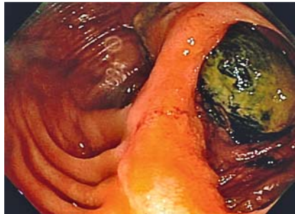
Fig. 1 Impacted fecalith at the site of ileocolonic anastomosis in a 71-year-old woman with Crohn's disease.