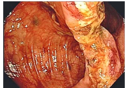
Fig. 4 Bowel wall after needle-knife stricturotomy and stone retrieval.