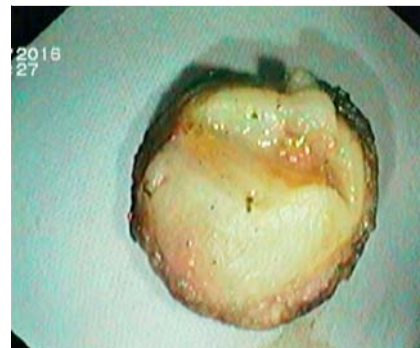
Fig. 3 The resected specimen.