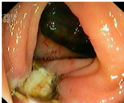
Fig. 2 View of the resection site: the clip sealed the colonic wall defect.