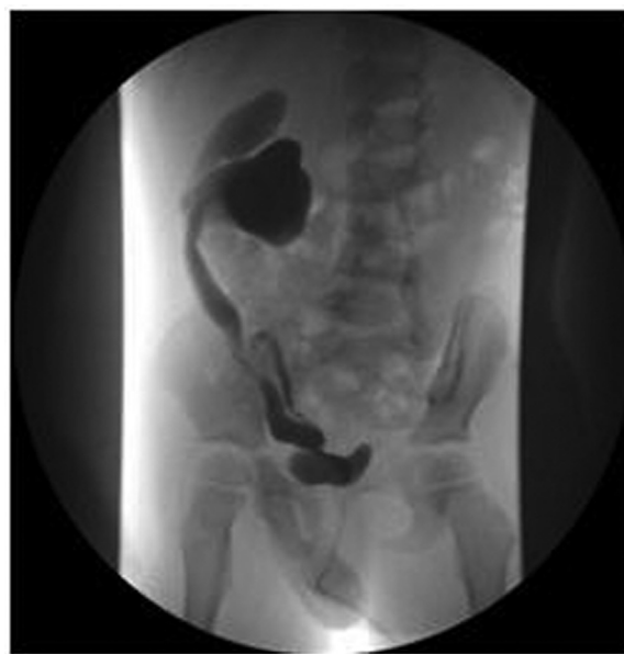
Fig. 2 Radiologic findings of a patient in our series with evidence of “persistent mesonephric duct syndrome,” in which an ectopic vas deferens joins the ureter and is then drained by a common channel.

Functional anomalies, such as neuropathic bladder and LUTD with high voiding pressures or detrusor sphincter dyssynergia, could also be considered as promoters of reflux and triggers of epididymal inflammation. In particular, external urethral sphincter dyssynergia may lead to voiding dysfunction with high urethral pressures and subsequent urethral valsal reflux and epididymal inflammation. 24,25 Neurogenic bladder was reported in 41% of our population with ARM and EO, thus supporting this hypothesis, but urodynamic data are lacking in this study. In addition, VUR was reported in almost half of our population, and this was similar to the series reported by VanderBrink et al. 8 VUR might be the indirect expression of voiding dysfunctions. Accordingly, Zaccara et al 7 compared ARM patients with rectourinary fistula experiencing EO to those without EO, and they found a significantly higher occurrence of VUR in the first group. Moreover, the majority of patients in our series had treatment for constipation. Fecal impaction is known to potentially interfere with the normal bladder emptying and functioning 26 ; therefore, it is mandatory to