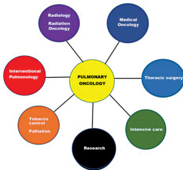
Fig. 1 Scope of the pulmonologist in pulmonary oncology.

after our evaluation, patients often turn out to have cancer mimicking conditions such as allergic bronchopulmonary aspergillosis (ABPA), tuberculosis (TB), chronic lung abscess, cryptogenic organizing pneumonia, sarcoid, anti-nuclear cytoplasmic antibody-associated vasculitis, pulmonary embolism or central airway disease, aspergilloma or fungal infections, etc. Undiagnosed mediastinal lymphadenopathy in a TB-endemic country like ours often poses a diagnostic dilemma. It requires further evaluation with endobronchial ultrasound (EBUS) or image-guided biopsy. We have been seeing a large number of such patients, and it is a worrisome trend as lack of awareness and access to specialized centers delays diagnosis, management, and overall prognosis of treatable diseases.