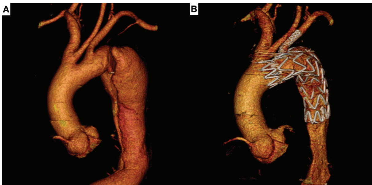
Fig. 3 Three-dimensional computed tomography reconstructions show the preoperative image of a Type B aortic dissection beginning close to the left subclavian artery (A), and the postoperative image with the physician-modified endograft well positioned in the distal arch, with patency of left subclavian artery, and no endoleak (B).

LSA and no Type-1 endoleak. One case of LBA disruption occurred during manipulation due to a small arterial diameter. An end-to-end reconstruction was immediately performed with good results.