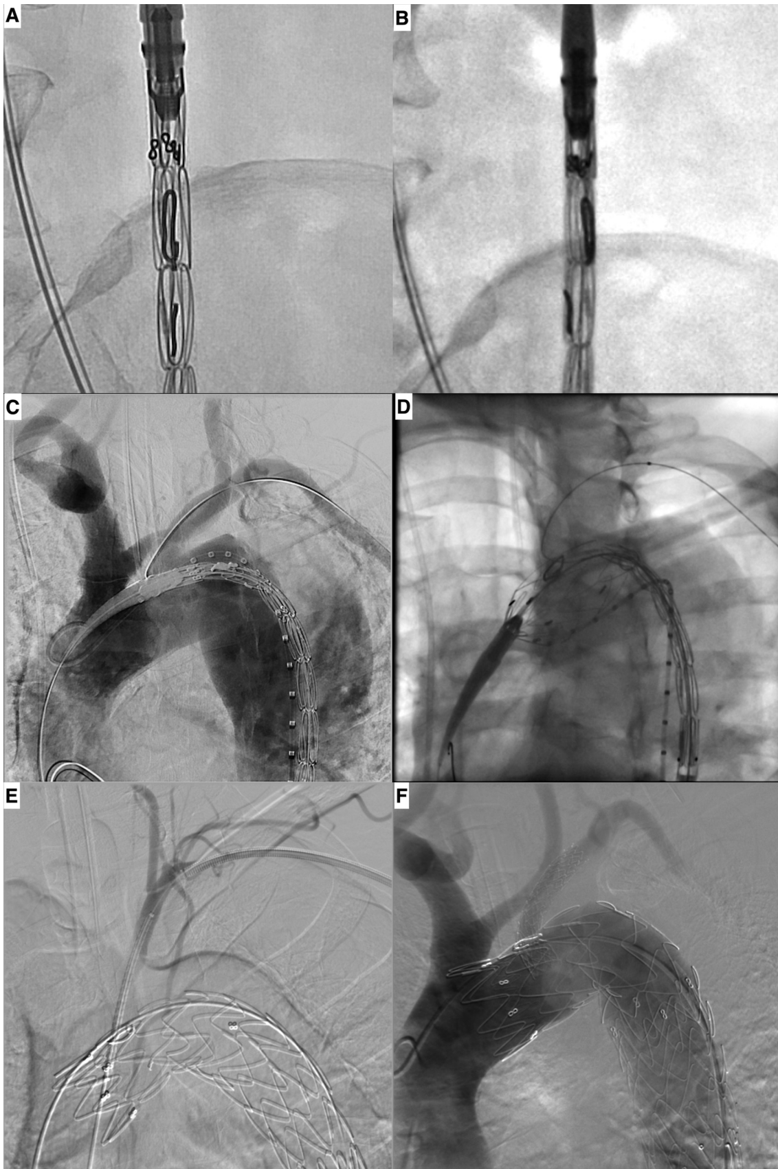
Fig. 2 Intraoperative images demonstrate the radiopaque marks in the resheathed endograft in anterior (A) and lateral (B) views. Aortography demonstrates the aortic arch anatomy (C). The endograft partially unsheathed and placement of an angioplasty balloon through the fenestration (D). Angiography demonstrates the vertebral artery (E) and a completion aortography shows the endograft positioning, the covered stent patency, and no endoleak (F).