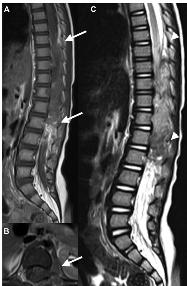
Fig. 1 (A) Sagittal T1-weighted MRI scan with contrast showing a heterogeneously-enhancing epidural mass at T8-L2 (arrows); (B) axial T1-weighted MRI scan with contrast showing an extension to the left intervertebral foramen (L1 / L2) with a paravertebral mass and homogeneous enhancement (arrow); (C) sagittal T2-weighted MRI scan showing a heterogeneously-enhancing epidural mass at T8-L2 (arrowheads).

positive/pan-cytokeratin positive/CD99 positive/friend leukemia integration-1 (FLI-1) positive.