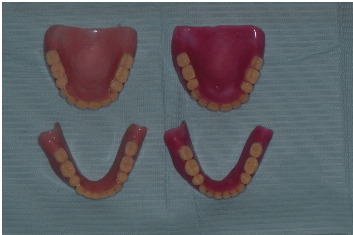
Fig. 2 Comparison of patient's existing dentures (on right) with copy dentures (on left).