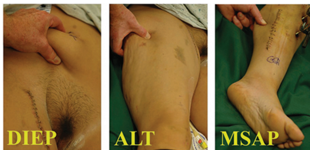
Fig. 4 “Pinch test” donor site comparison in another individual with deep inferior epigastric perforator (DIEP), anterolateral thigh (ALT), and medial sural artery perforator (MSAP)—proving typically to be the thinnest.