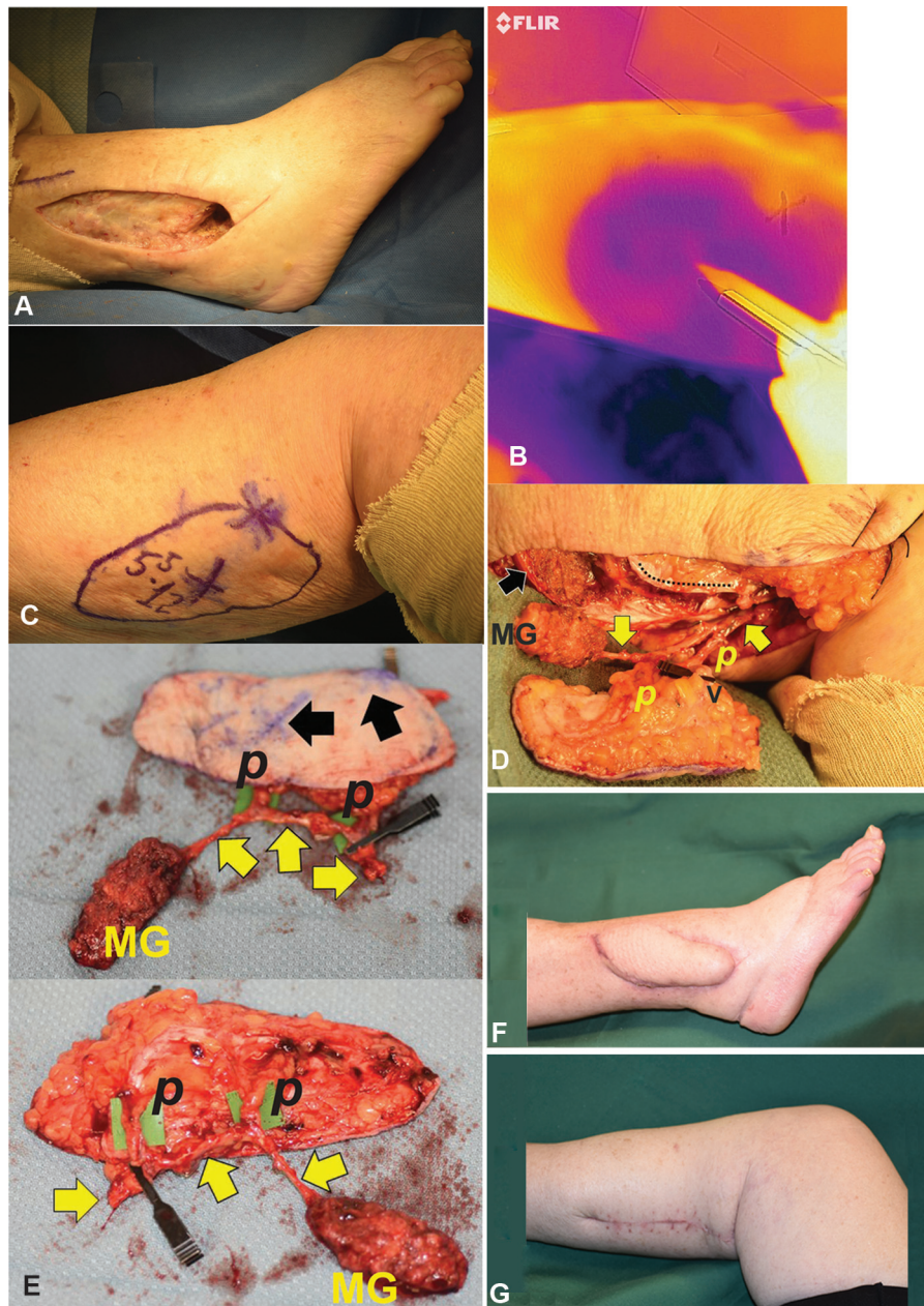
Fig. 3 (A) Failed right ankle pilon fracture reduction, with open lateral malleolus wound extending into ankle joint. (B) Using a thermography camera, the second “hotspot” seen marked on the medial calf as was the spot “X” above. (C) Medial sural artery perforator (MSAP) flap designed on the medial calf to potentially include both perforator sites “X,” as determined by thermography. (D) Chimeric MSAP flap in situ, with perforators (P) found exactly at predicted points “X,” vascular clamp on the greater saphenous vein branch (V) available for supercharging, course of the medial sural artery superficial intramuscular source branch (proximal yellow arrow), continuation of this branch (distal yellow arrow) past the second perforator origin to independently supply a small portion of the medial gastrocnemius muscle (MG) that will be inset into the cavity entering the ankle joint, harvest site of the MG (black arrow), rent through the MG for pedicle harvest (inferior to dotted line). (E) Free chimeric MSAP flap, predicted perforator sites “X” (black arrows) corresponded to their actual location (P [yellow arrows follow course of medial sural pedicle]). (F) Right lateral ankle status 5 weeks posttransfer prior to fusion. (G) Typical final calf donor site scar.

rapid posterior retraction of the flap above a bloodless subfascial plane, except where the perforator is located. Be careful of the corkscrew path of the perforator, as it may exit the MGM at a point even a few centimeters away from where it perforates the deep fascia. Towels placed on the operating room table under the flap as it falls backward will serve as a cushion that will prevent excessive tension on the perforator during the next steps. 72