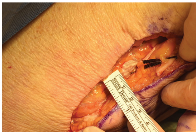
Fig. 5 This medial sural artery perforator (MSAP) flap thickness as measured in situ was 2.0 cm. The same flap used for ► Fig. 3 was used here.