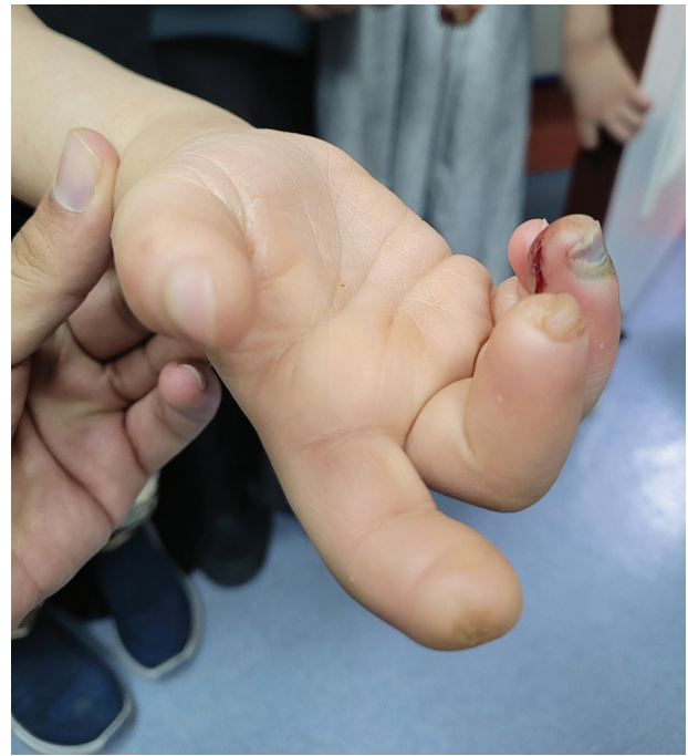
Fig. 2 Auto amputated fingers.

He had multiple scratch marks on his body, a large bleeding mouth ulcer, and several small ulcers on his fingers.