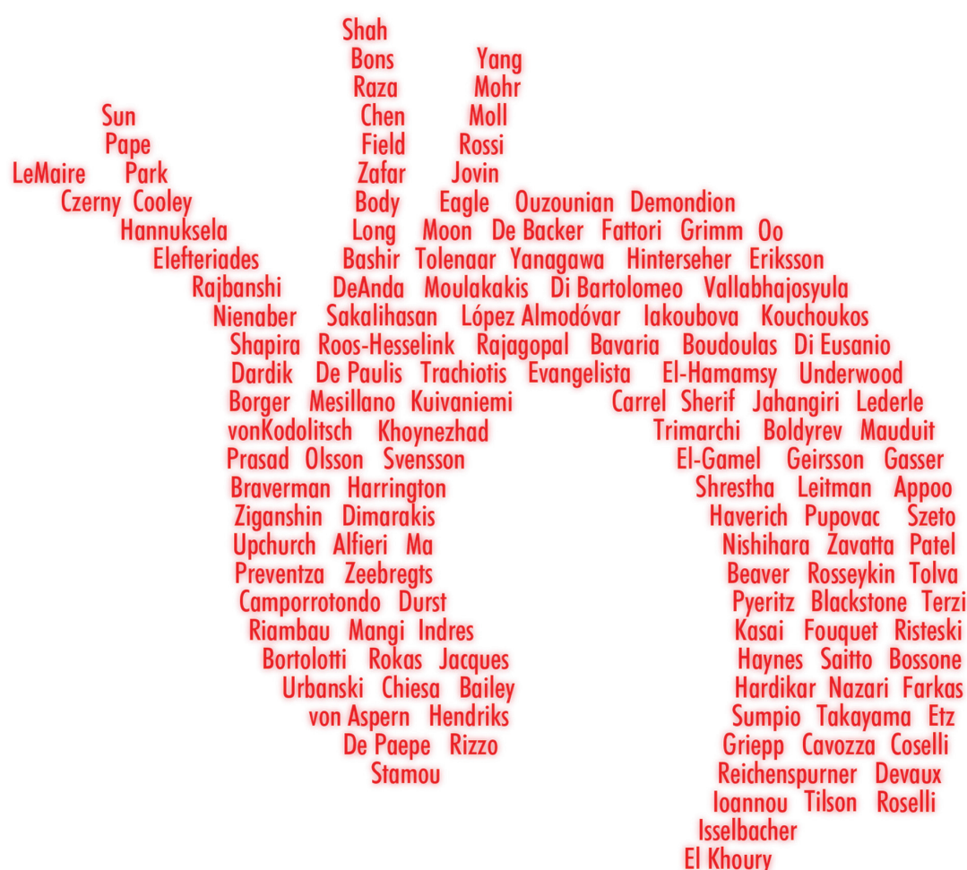
Fig. 1 Artistic rendition of the partial list of authors who have published in AORTA .

cation. These have reflected insight, imagination, and, very often, surgical courage. The accompanying collage (► Fig. 1 ) represents just a fraction of the distinguished worldwide authorities who have published their work in AORTA . In