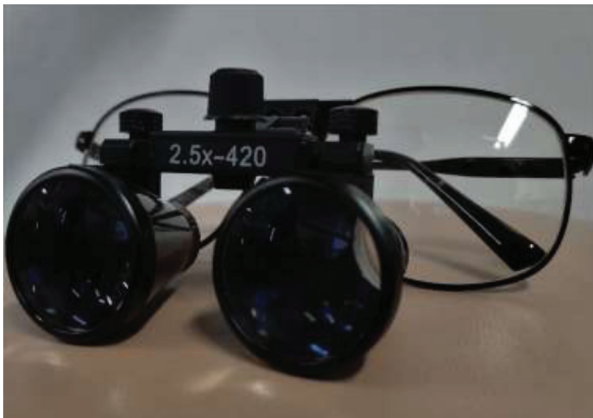
Fig. 2 Loupes.

the need and is available as a headband or the front frame-mounted system (→ Fig. 2 ). 6