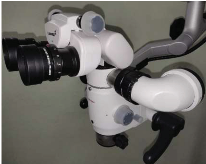
Fig. 3 Surgical operating microscope.

diopter that can be set from -5 to +5 to focus the lens. Diopter setting and interpupillary adjustment should be made prior to the use by the operator and should remain unchanged. 13