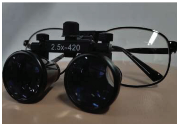
Fig. 2 Loupes.

the need and is available as a headband or the front frame-mounted system (→ Fig. 2 ). 6