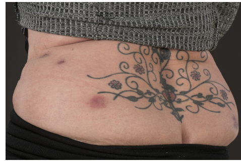
Fig. 2 Four months postprocedure—posterior view of buttocks.