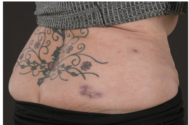
Fig. 4 Four months postprocedure—right hip and buttock region.

surgery. The treatment areas in question were the buttocks, hips, and flanks bilaterally. The patient reported shooting pains down the posterior aspect of her right leg, painful nodules in the injected areas, fevers, and severe pain when the treated areas came into contact with clothing. She had no past medical history and had received the treatment from a cosmetics clinic, where the injections were administered by a nonhealth professional. On examination, there were several firm nodules in the injected areas, tender to palpation with focal skin necrosis (see ► Fig. 1 ). Written informed consent was obtained from the patient and clinical photography was performed.