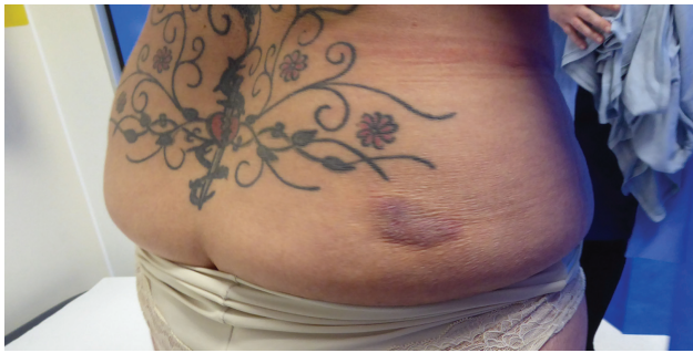
Fig. 1 Two months postprocedure—posterior view of buttocks.