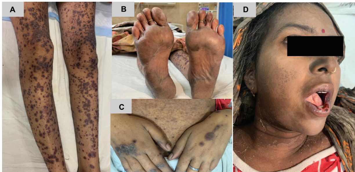
Fig. 1 (A) Pruritic plaques on an erythematous base, (B) plantar erythrodysesthesia, (C) hyperkeratotic plaques over dorsum of hand, (D) oral mucositis and facial skin in healing stage with peeling of epidermis.