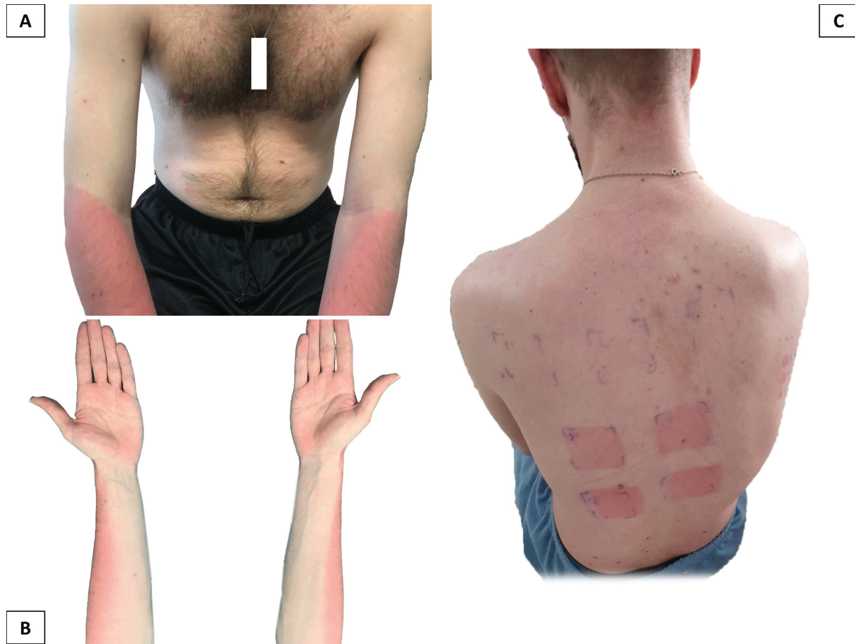
Fig. 1 (A, B) Appearance of cutaneous erythema in photoexposed areas. (C) Phototest revealing erythema and edema.