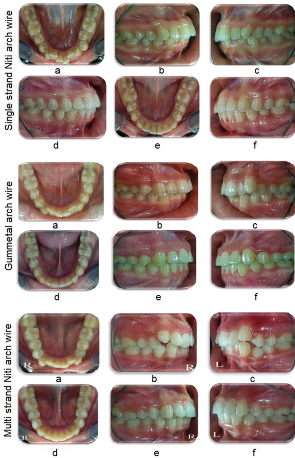
Fig. 3 Intra-oral photographs of the representative patients treated using the arch wires (A) pretreatment right side view, (B) pretreatment occlusal view, (C) pretreatment left side view, (D) posttreatment right side view, (E) posttreatment occlusal view, (F) posttreatment left side view

used nickel-free and NiTi archwires to deliver buccal tooth movement that reported no difference between the two archwires. In addition, the present outcomes are in general agreement with laboratory studies which showed that the clinical performance of Gummetal archwires could be comparable to NiTi, as they generate forces and have low stiffness and Young's modulus. 26,27