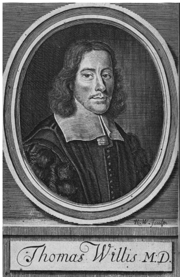
Figure 1 Thomas Willis (1621–1675). Licensed under a public domain mark.

That year, Willis began his medical studies, but his education was interrupted after the English civil war started and Oxford was turned into a garrison town. He sided with