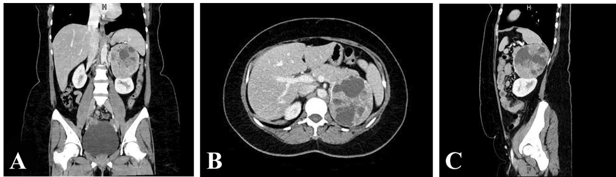
Fig. 1 (A) Coronal, (B) transverse, and (C) sagittal sections of the computed tomography of the abdomen in the arterial phase of contrast enhancement. A large inhomogeneous lesion with cystic components can be seen in the left upper quadrant of the abdomen. The lesion abuts and compresses both the spleen and the upper pole of the left kidney (B and C). There is no evidence of local invasion, other masses, regional lymphadenopathy, or metastases to the parenchymal organs.

was extracted through a Pfannenstiel incision (→Fig. 2). The patient was discharged home on the second postoperative day.