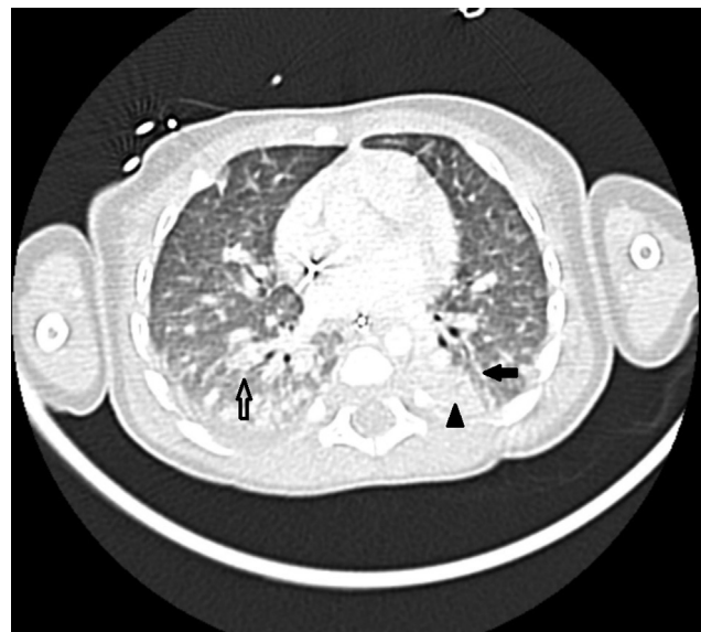
Fig. 1 Chest computed tomography showing atelectasis in the dorsal segments of the lungs (arrowhead) and signs of global interstitial septae thickening (black arrow) with bilateral peribronchial and peripheral alveolar filling foci associated with areas of ground-glass opacifications (white arrow).

Systemic methylprednisolone of 10 mg/kg/d for 5 days was started, achieving a partial and transient response with an improvement of hypoxemia and pulmonary hypertension. Unfortunately, the patient developed refractory hypoxemia again, and interstitial infiltrates on chest radiography in the following days. New echocardiography showed biventricular hypertrophic cardiomyopathy without systemic hypertension (right ventricular end-diastolic diameter of