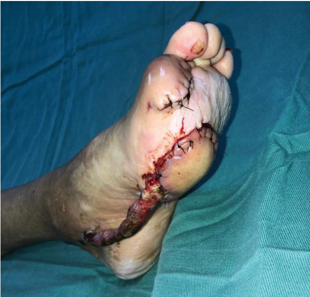
Fig. 1 “Hanging” pedicle immediately postoperatively, covered with skin graft.

Additionally, these procedures are time-consuming and can result in added incisions in an already ischemic limb with healing difficulties.