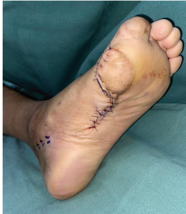
Fig. 2 Wound following incorporation, pedicle division, and flap revision.

To decrease operative time and minimize the number of incisions and risk of wound healing complications, we suggest the use of the “hanging” free flap for the reconstruction of chronic lower extremity diabetic ulcers. Following patient optimization and adequate wound debridement, our reconstruction involves standard free flap harvest, end-to-end microsurgical anastomosis, and inset. Following flap inset, we cover the “hanging” pedicle with a skin graft instead of making extraneous incisions within the undisturbed soft tissues or tunnels that can compress the vessels (→ Fig. 1 and → Video 1 ). While the flap incorporates, the exposed pedicle is protected with a soft dressing. After incorpo-