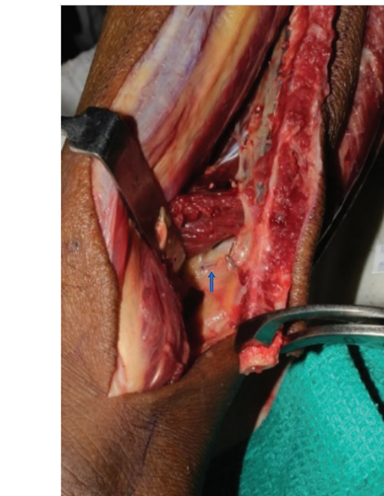
Fig. 1 Septocutaneous arising from the posterior tibial artery deep to FHL (blue arrow).

Yadav et al 1 proposed a classification system of the fibula skin vasculature which was based on the axial supply of the skin paddle into four types as follows: type A, supplied by peroneal vessels; type B, by peroneal vessels and posterior tibial vessels (PTV); type C, by PTV only; and type D, by popliteal artery only. This was further subcategorized by Parr et al 2 into subtypes A1, A2, A3, or B1, B2, B3, and C1, C2, and