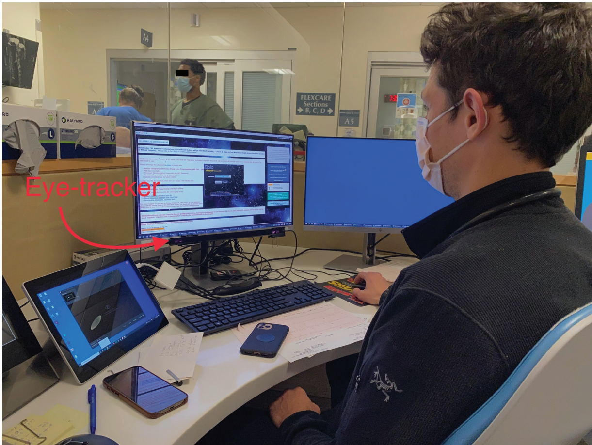
Fig. 2 Eye tracker setup.

Abbreviations: FVAS, fatigue visual analog scale; PTL, physician task load; SD, standard deviation; SSS, Stanford Sleepiness Scale.