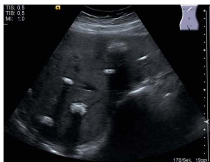
► Fig. 1 Ultrasound of the liver showing hyperechoic calcified liver metastases with posterior acoustic shadowing.

In the case presented here, imaging findings and liver biopsy ruled out the initially suspected choroidal melanoma, leading instead to the diagnosis of a pulmonary NET with metastatic spread to the liver,