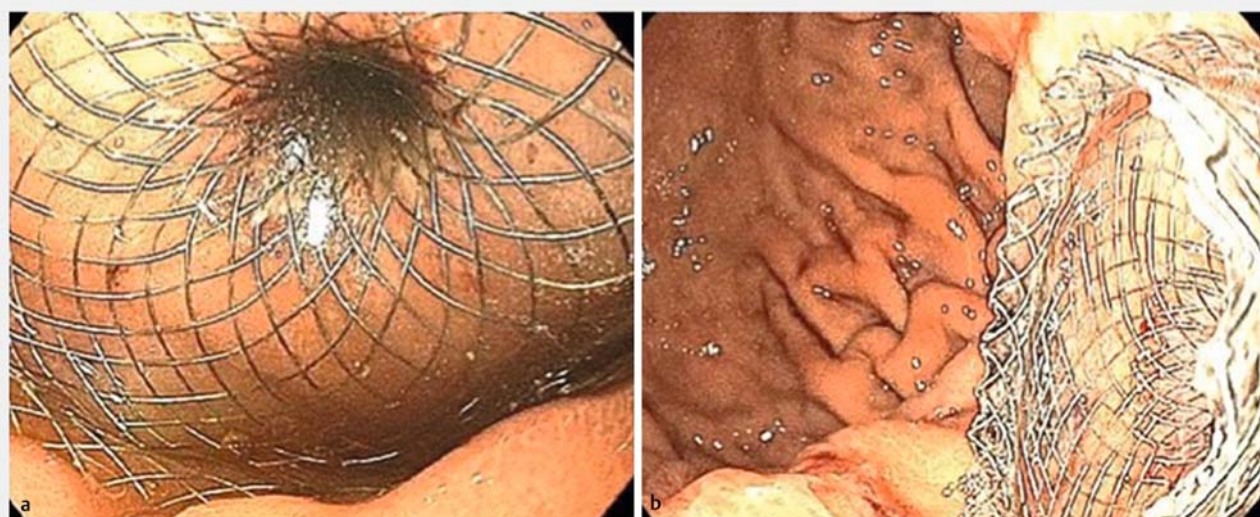
► Fig. 2 Lumen-apposing metal stent (LAMS) placement. a The first LAMS was placed in the duodenal bulb. b The second LAMS was placed in the stomach.