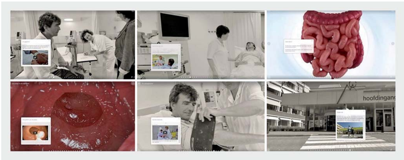
► Fig. 2 Several screenshots from the computer-assisted instruction (the people in these stills are actors).

ported by photo's, 3D animation and instructive texts (► Fig. 2 , CAI is available in Dutch via https://trials.medify.eu/cai-colonoscopy ). The video was presented in short clips, maximum of 45 seconds, to maintain patient focus. Patient interaction was ascertained by a mandatory mouse-click after each item in the CAI.