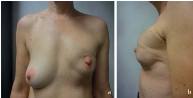
► Fig. 1 A 34-year-old patient, 7 months post subcutaneous mastectomy (status post primary chemotherapy, status post radiotherapy). Immediate reconstruction using subpectoral implant placement with caudal mesh interposition. Currently with grade III capsular contracture, implant cranialisation and empty volume in the caudal quadrants.

of >40, in immunosuppressed patients, with HBA1c >7.5%, due to nicotine abuse or too little fat tissue for subsequent lipofilling. In the opinion of the authors, and from the oncological viewpoint, contraindications include breast carcinomas of >5 cm, advanced or deep-lying breast carcinomas, breast wall infiltration, extensive nodal involvement and a high risk of local relapse. However, the discussion also contains a critical assessment of whether the oncologically determined contraindications are based on assumptions. From our perspective, these restrictions do not exist.