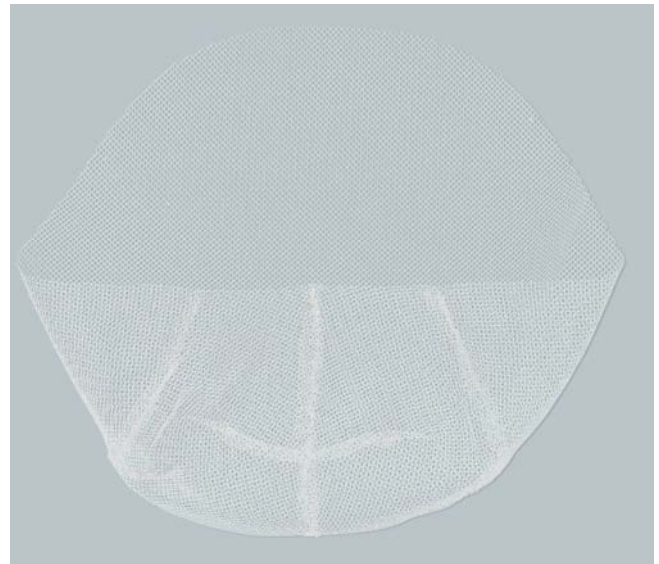
► Fig. 2 Synthetic mesh specially designed for prepectoral implant placement (TiLoop® Bra Pocket)

The authors of this discussion contribution also use synthetic meshes to cover prepectorally positioned implants just as frequently as ADMs and tissue matrices [23]. Similarly, some patients with epipectoral implant placement and TiLoop® Bra coverage were included and evaluated in the PRO Bra-Trial [24, 25]. Observations of possible complications and problems also arise from this experience in individual cases. New materials are also being developed in the field of synthetic meshes. Building on the experience of D. Casella et al. [26] and M. Rezaei, a titanised polypropylene implant pocket was developed, considerably simplifying prepectoral implant placement with a full covering of titanium mesh (► Fig. 2, 3 ).