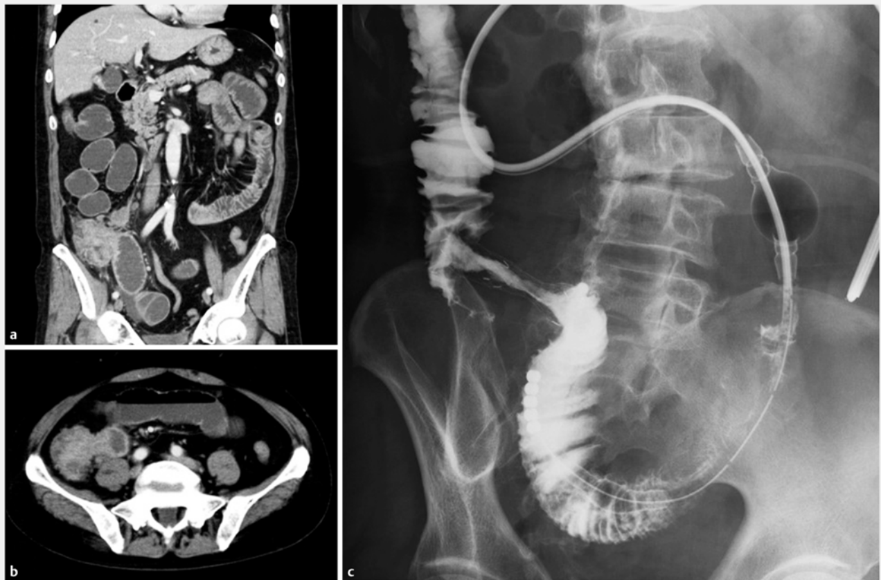
► Fig. 1 Images of Patient 1. a, b Contrast-enhanced computed tomography scan reveals thickened ileocecal stenosis with proximal dilation of the colon and distal small intestine. c Contrast medium was injected from the decompression tube, revealing the stenosis and terminal ileum clearly.

passed over the 0.025-inch guidewire (Visiglide, Olympus). Inserting the catheter into the ileocecal valve is difficult because of its angled anatomy. In such situations, we passed the stricture with the ERCP catheter with a movable tip (Swing Tip Canula, Olympus). Subsequently, the contrast medium was injected