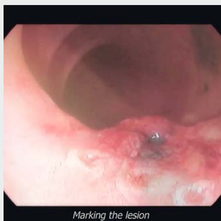
Video 1 Full-length video of endoscopic full-thickness resection in patient #4 performed with the Full-Thickness Resection Device (FTRD®) System.