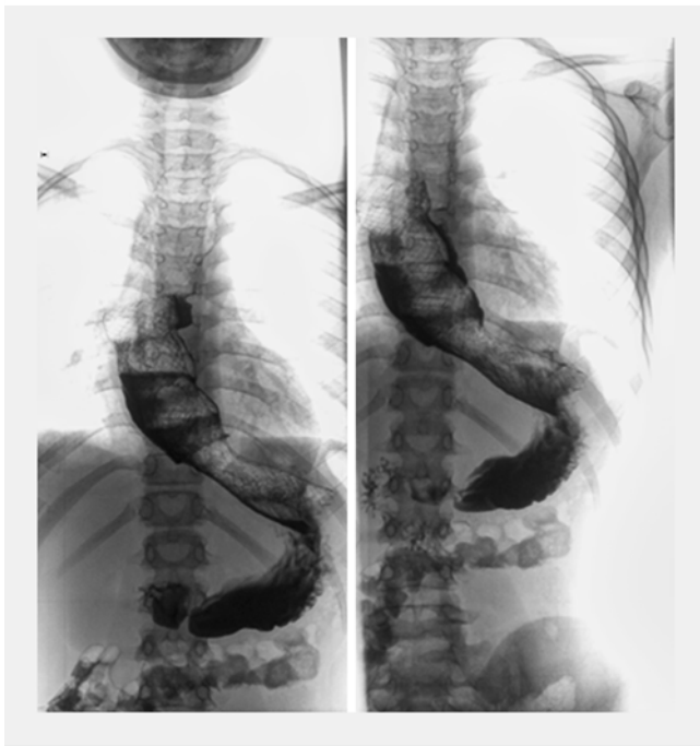
► Fig. 1 Stent placement.

pain and >10 kg of weight loss). We performed esophageal manometry, which confirmed the diagnosis of achalasia type I. Due to a previous LHM, posterior POEM was considered as an alternative, however, the procedure was not performed in the country by any institution. Moreover, performing PD is associated with a concern about EP and a decision was made to place a stent [Niti-S Esophageal Covered Stent (Double-type) Taewoong Medical] 30 mm in diameter and 60 mm long (after approval by the ethics committee of our institution and signing of informed consent by the boy's parents). The patient reported retrosternal discomfort during the first 48 hours, which was treated with oral paracetamol. There were no major adverse events (AEs) post-procedure (► Fig. 1 ).