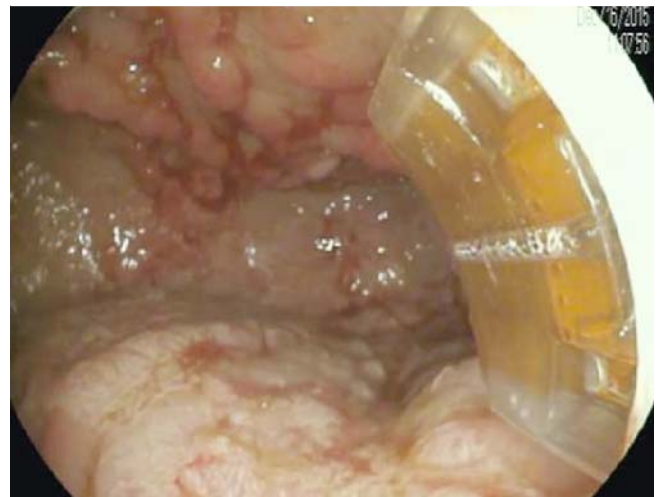
► Fig. 2 Application of treatment with RFA using Halo-90. The area from 4 to 7 o'clock shows treatment effect.

of this study, we do point out that currently, RFA catheters are considerably more expensive than those used for APC. At our institution in the United States, our current costs are $243.50 for the single-use APC catheter used in this study and $1222 for the HALO-90 catheter.