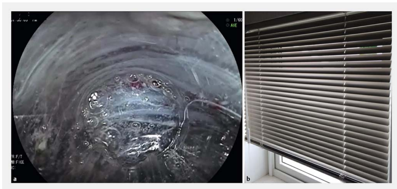
► Fig. 1 The window-blind appearance. a The inner circular muscle layer in the distal rectum has many loose transverse gaps that look like; b a window blind.

Endoscopic submucosal dissection (ESD) is increasingly used as a minimally invasive technique for treating superficial gastrointestinal tumors. Rectal ESD using the pocket-creation method (PCM) [1] is relatively easy for endoscopists who are used to performing submucosal endoscopy (e.g. peroral endoscopic myotomy [POEM]), even if they have not performed many ESD procedures.