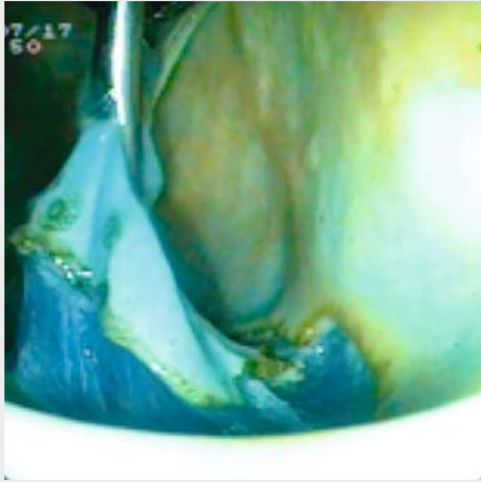
Video 1 Magnet assisted ESD performed in ex vivo gastric fundus.