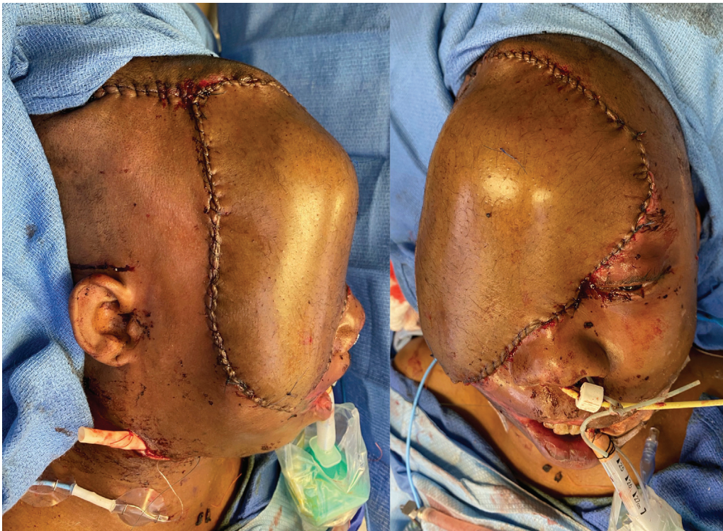
Fig. 2 Immediate postoperative appearance after free anterolateral thigh (ALT) flap reconstruction.

The patient was admitted to our institution's Burn and Complex Wound Center. Notable admission laboratory findings included hemoglobin (Hgb) 7.8 g/dL and HbS 7.0%. Although his HbS value was unusually low, most likely due to receiving blood transfusions during recent admissions at outside hospitals, the patient's HbS 1 year prior was 55.3% which is more consistent with SCD. Venous duplex imaging demonstrated a partially occlusive DVT of the gastrocnemius vein corresponding to his right lower extremity swelling and pain. Hematology was consulted and recommended packed red blood cell (pRBC) transfusion with goal Hgb > 10 g/dL, exchange transfusion as needed to keep HbS < 30%, and 3 months of anticoagulation for the DVT. The patient was transfused 2 units of pRBCs to bring his Hgb to 10.0. As the HbS was 7.0%, no exchange transfusion was performed, and a therapeutic heparin drip was initiated for anticoagulation.