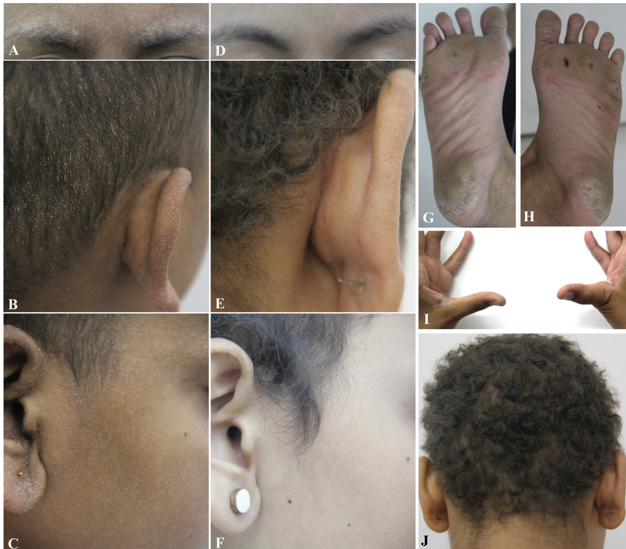
Fig. 1 Skin-colored to whitish, pin-point, spiny follicular hyperkeratotic papules over the (A) eyebrows, (B) scalp, and (C) ears; (D, E, F) Complete clearance of rash following sorafenib dose reduction and topical keratolytic application; (G, H) Hyperkeratotic hand-foot skin reaction involving the pressure points of soles; (I) Fissured scaly plaques over first finger web space bilaterally; (J) Regrowth of curly hair following chemotherapy induced anagen effluvium.

Six months later, on examination, there were no signs of SFH (►Fig. 1D–F). However, she complained of tender yellowish thickening of skin over pressure points of soles (►Fig. 1G, H), fissured scaly plaques over first finger web space bilaterally (►Fig. 1I), multiple acquired melanocytic