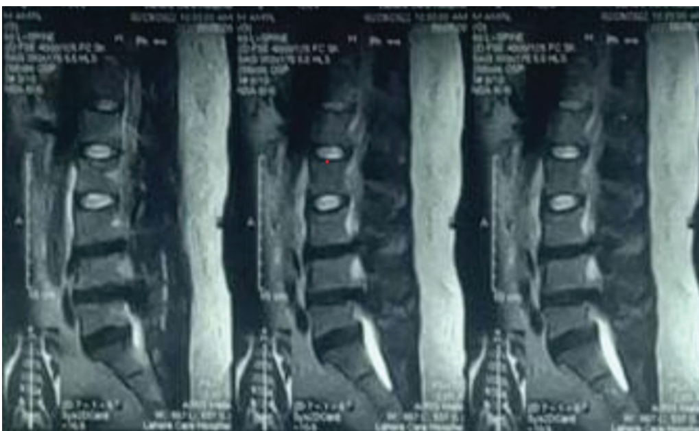
Fig. 1 Magnetic resonance imaging lumbosacral spine T2 sequence. Sagittal view showing lumbar stenosis most pronounced at L4/L5 and prolapsed intervertebral discs at L3-L4 and L5-S1.

A 34-year-old male presented due to our neurosurgery department with a long-standing history of lower back pain, which began radiating bilaterally to his lower limbs over the last 4 months. His condition had deteriorated further over the last 10 days with increasing pain, restricted straight left leg raising ability, and numbness at the L5 dermatomal territory in his left foot. Power was 5/5 (Medical Research Council scale) bilaterally, and reflexes were mildly brisk. An magnetic resonance imaging of the lumbosacral spine revealed lumbar stenosis most pronounced at L4/L5 and disc bulges at L3/L4 and L5/S1 (–Figs. 1 and 2). His visual analogue pain score (VAS) was now 6. The patient was a police officer whose symptoms now severely hindered his job, causing time off and stress, significantly impairing his