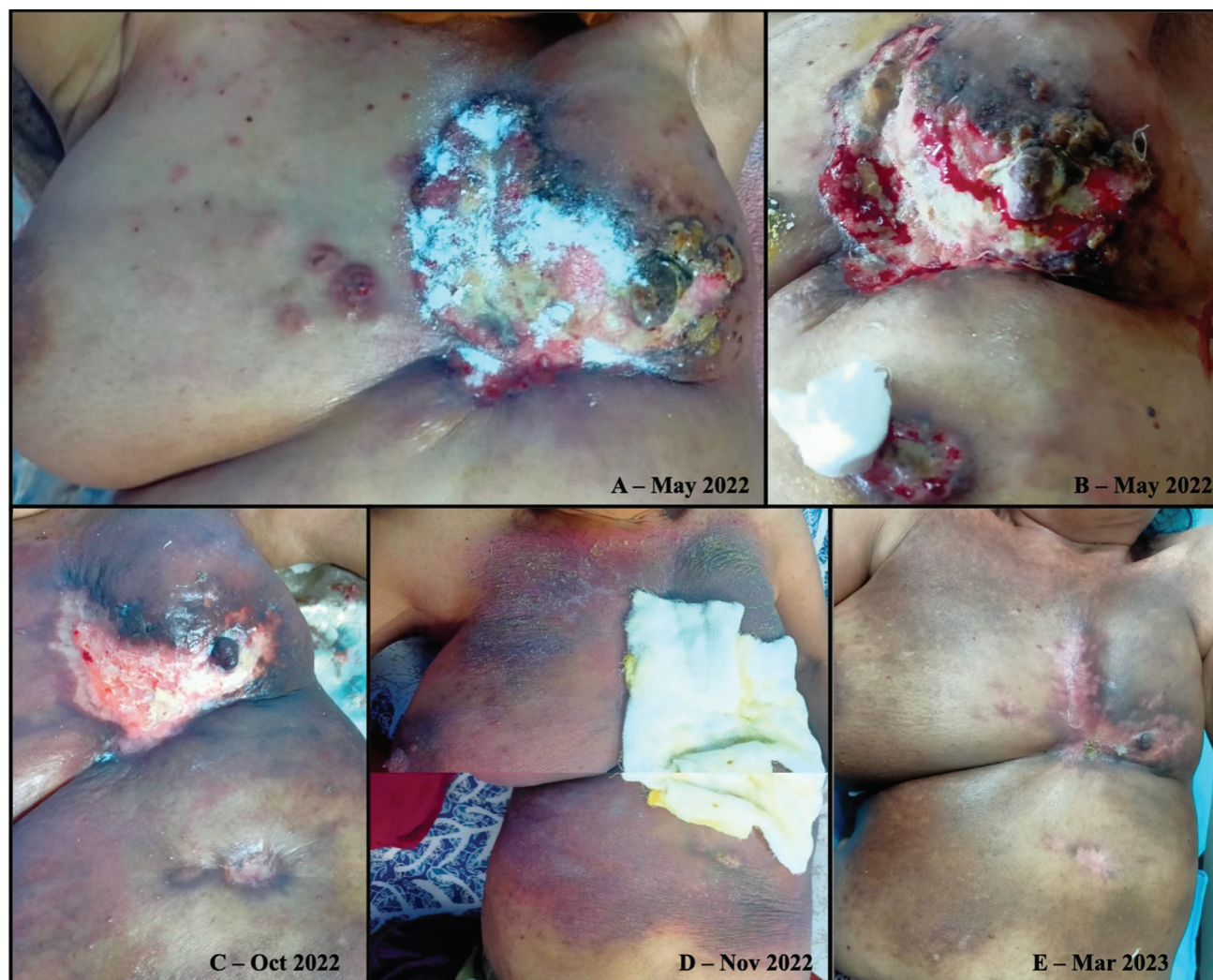
Fig. 1 (A,B) Chest wall and abdominal skin lesions prior to initiation of abemaciclib + letrozole (May 2022) and (C-E) its regression with treatment to date.

emission tomography computed tomography (FDG PET CT; ► Fig. 2A, C ) revealed a 3.3 \times 3.6 cm left breast upper inner quadrant mass infiltrating the overlying skin with ulceration (maximum standardized uptake value [SUVmax] 11.24), multiple cutaneous deposits below the xiphisternum, largest 3.9 \times 6.0 cm (SUVmax 12.02), right breast lesion 4.1 \times 3.7 cm (SUVmax 11.87), right axillary lymph node 2.5 \times 2.2 cm (SUVmax 9.43), right anterior diaphragmatic lymph nodes 2.8 \times 3.2 cm (SUVmax 5.27), periportal lymph node 1.5 \times 2.6 cm (SUVmax 8.27), lytic lesion in the manubrium and the body of the sternum with soft-tissue component 3.1 \times 5.1 cm (SUVmax 7.63), multiple subpleural and parenchymal lung lesions (SUVmax 5.98), and an FDG avid lesion (SUVmax 4.47) in segment IVB of the liver without associated CT changes. Blood panel for renal and hepatic functions were adequate. Thus, she was diagnosed as metastatic hormone receptor positive breast cancer without visceral crisis.