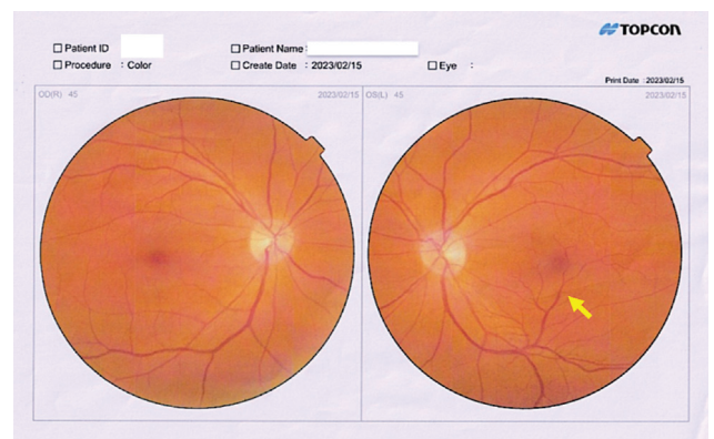
Fig. 1 Color fundus photographs of the right eye (OD) and left eye (OS), showing a left eye macrovesSEL.

Optical coherence tomographic angiography (OCTA; DRI OCT Triton plus, Topcon Medical Systems, Inc., Europe) was normal for the right eye. It detected no alterations, except for the presence of the macrovesSEL branching superiorly at the edge of the fovea, a vascular zone in the left eye ( Fig. 3 ).