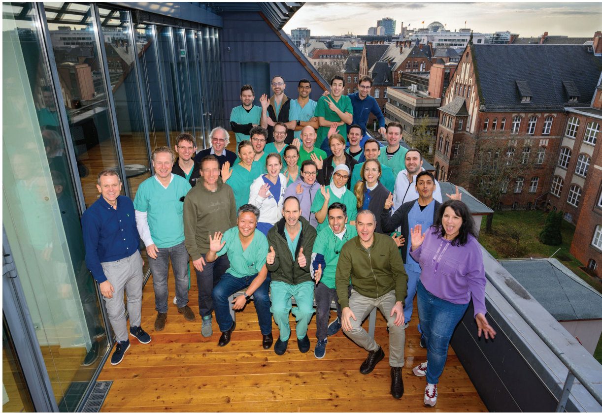
Fig. 1 Strong German Hearts 2023 at the Langenbeck-Virchow-House in Berlin, Germany.

36-hour shift as past generations used to, as an aim to finish the program. Alongside the motivated trainees, there were highly qualified and eager coaches, specialized trainers from the Federal Police, and supporters from the organizing team. The journey started the next morning at 7 a.m. Each candidate received a personal file including the detailed schedule and respective tasks for the psychological and concentration evaluations, which later would be analyzed by professionals.